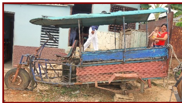
Work in Progress: Motorized Taxi

Bici-taxi Update - There are some exciting updates from one of the projects previously visited. The last newsletter on Cuba mentioned a bici-taxi project that was used in many ways to help the church. At the time of the last visit, just about two years ago, the people who received the loan also oversaw two churches. Now, we are thrilled to hear that it has grown to five churches! The expansion of the church, as well as the distance in between these partner churches, is part of what compelled them to invest in a larger taxi project. They also said, in good humor, that at 63 years old the pastor was finding it difficult to pedal by day and speak at night! The decision was made to purchase the frame for a motorized taxi that is more rugged and has more capacity than the previous bici-taxi. This new taxi will fit 11 people besides the driver. This will be very useful among the churches, and will also generate more income. What's more, once they are able to sell the bici-taxi and buy the remaining parts needed, they expect a net profit!