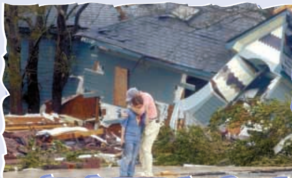
Grieving victims of Hurricane Katrina

The verse quoted from Romans is a tremendous comfort to all those who are in Christ, because we trust, we move forward in this world with confidence, joy, and peace. We