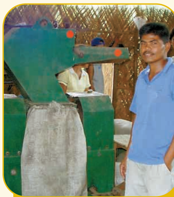
Plastic recycling project Pangasinan, Philippines