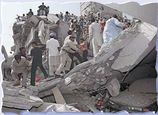
Earthquake in Kashmir, Pakistan

villages. Many areas are still digging out and are in need of massive aid just for survival. It has been one of the most trying times in recent memory from a natural