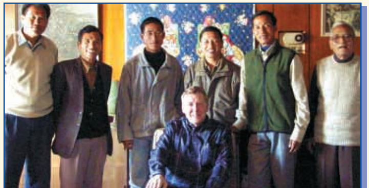
Christian Families Helping Hands committee, Nagaland

• Nagaland, India became the site of our second program on the subcontinent. Nagaland is in the northeastern corner of India, bordering Myan-