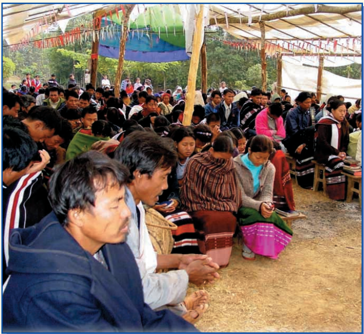
Nagas at prayer during day of prayer and fasting