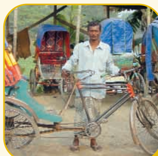
Van rickshaw project, Bangladesh