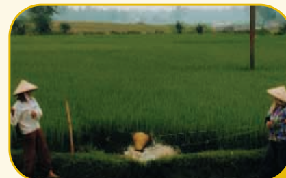
Hand irrigation, Vietnam